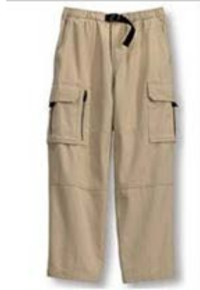
“Unacceptable” Cargo pants