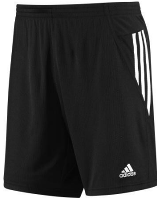
“Unacceptable” Athletic shorts