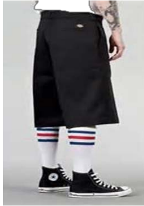
“Unacceptable” Cargo shorts